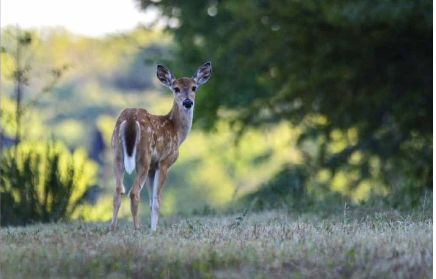
A white-tailed deer stands in a field at the edge of a forest.