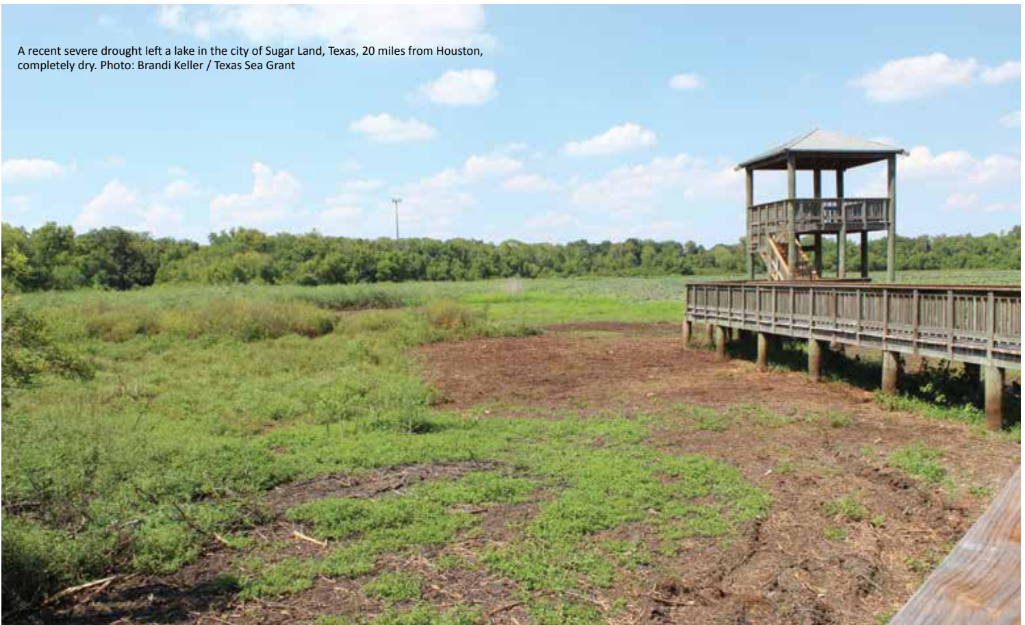
A recent severe drought left a lake in the city of Sugar Land, Texas, 20 miles from Houston, completely dry.